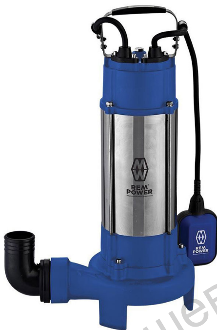
SPG 18502 CDR